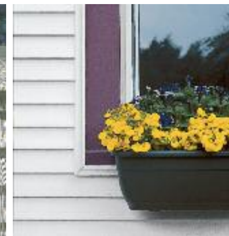
Trimworks® custom crown molding used with wood window trim.