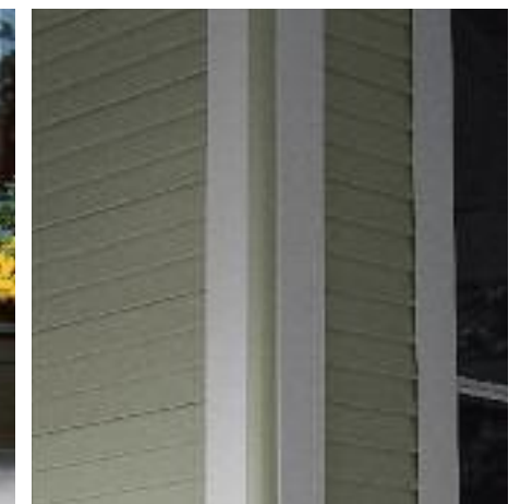
Trimworks® three-piece beaded corner post.