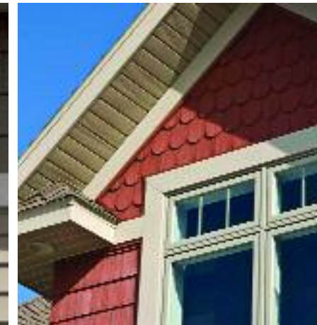
Alside Premium Scallops – Victorian inspired half-round shingles.