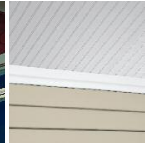
Greenbriar® Vintage Beaded soffit and Trimworks® soffit crown molding.