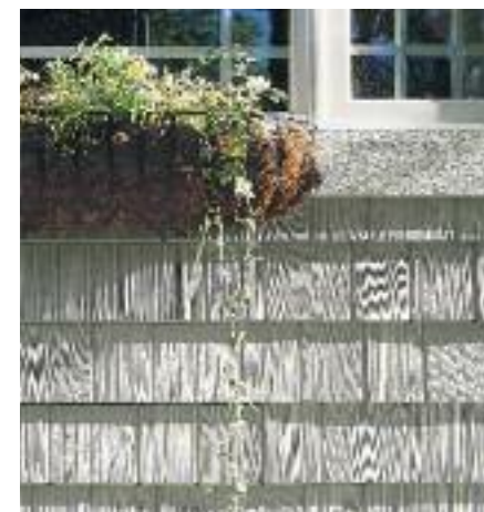
Alside Premium Shakes – the classic look of deep-grained cedar shakes.